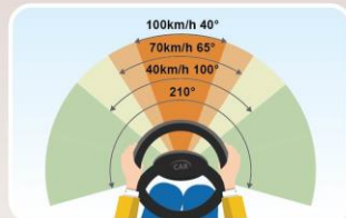
Chart 2 The slower a car's speed, the wider the driver's field of vision. 圖2 行車速度愈低，駕駛人視野愈廣